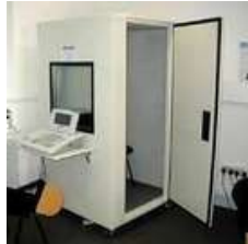
Audio Metric Chambers