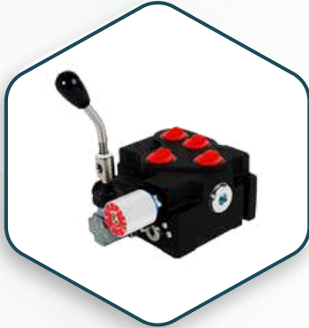
Hydraulic Control Valves