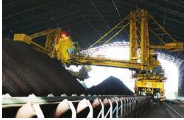
Bucket Wheel Assembly