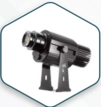
Logo Projection Lights