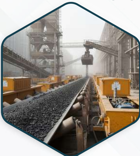
BULK MATERIAL HANDLING