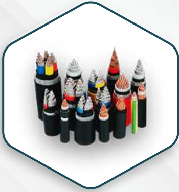
Cables & Wires