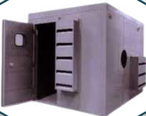
Sound Proof Acoustic Enclosure