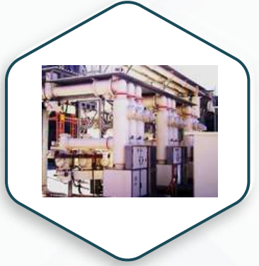
MV - GIS/AIS/RMU