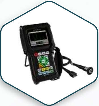
NDT Thickness meter