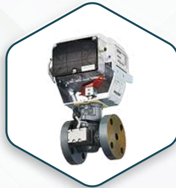
Valves & Actuators