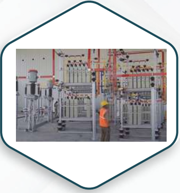
MV/HV Capacitor Banks