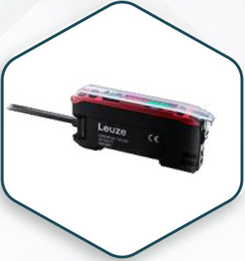
Fiber Optic Sensors