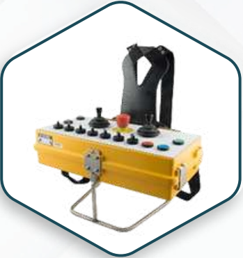
Portable Control Panels