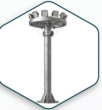
High Mast Lighting