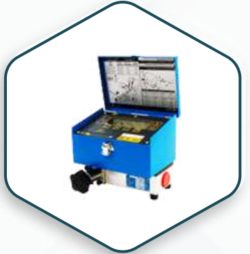
Portable Hydraulic Testers