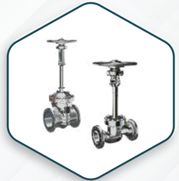
Gate & Globe Valves