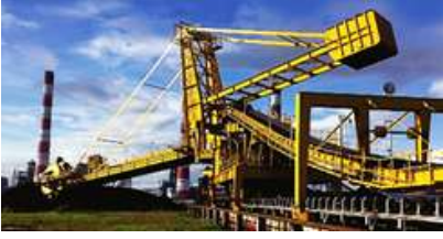
Combined stacker reclaimer