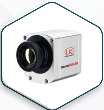
Thermal Imaging Camera