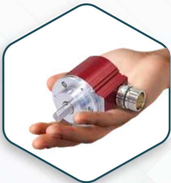
Absolute Rotary Encoders