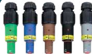
Powersafe Power Connectors