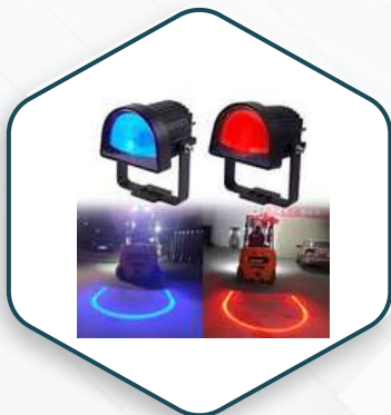
Forklift Arc Light