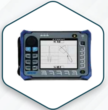
eddy current flaw detector