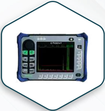
UT Flaw Detector