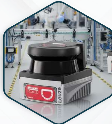
SAFETY & SENSOR