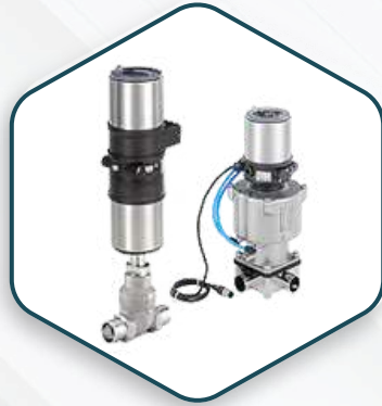
Process and Control Valves