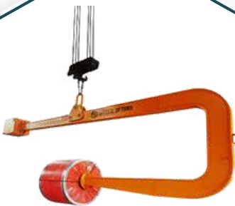
Coil Handling Equipments