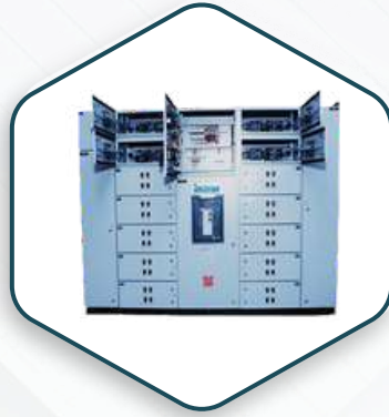
HT & LT APFC Panels