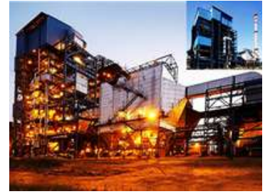
Circular Fluidizer bed combustion boilers