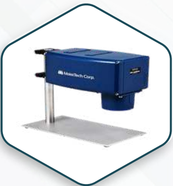
Online Moisture Sensor