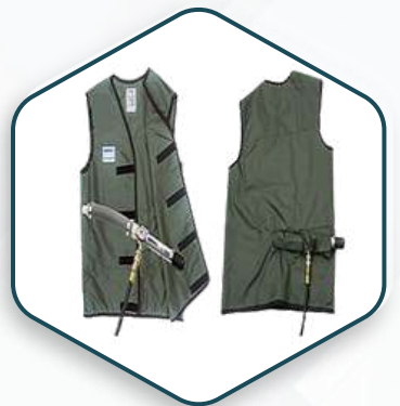
Vortec Cooling Vest