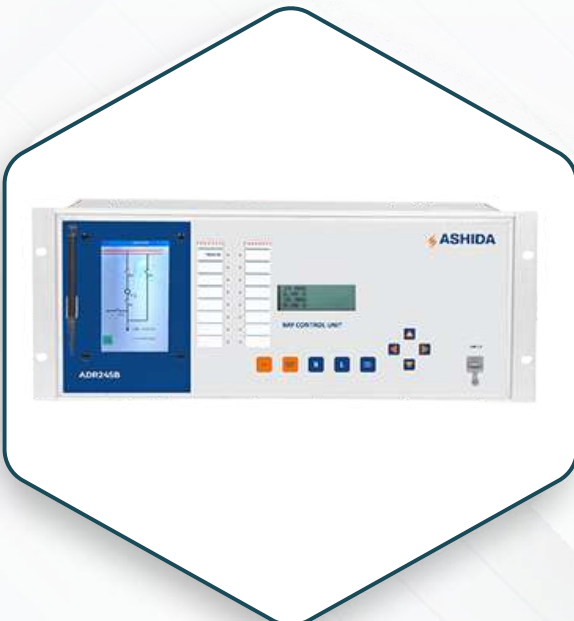
SAS & SCADA Systems