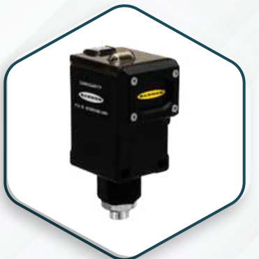
Wireless Condition Monitoring Sensors