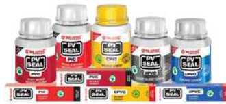
Leak Repair Solutions