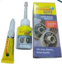
Cold Repair Compounds